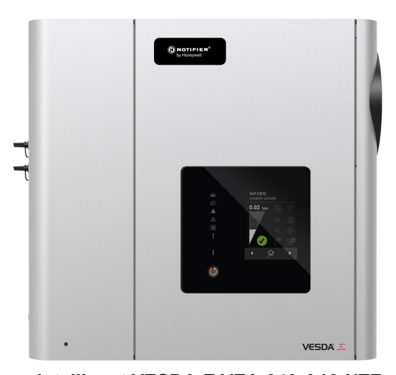
Intelligent VESDA-E VEA-040-A10-NTF

The VEA detector draws a combined air sample from a network of up to 40 microbore flexible tubing from all sampling points in the protected area, then filters and analyzes the sample in laser detection chambers in the smoke sensor module. When smoke particles are detected and the smoke level reaches set alarm thresholds,